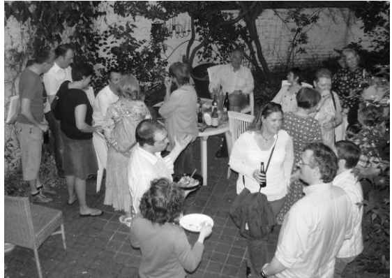
The calm before the storm - Four days to go and counting!

Feats as a festival shows that we all have much more to learn and enjoy in what we and others, our friends from across